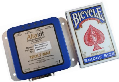
Very Small ~110x88x17mm

O-Scope A/D Signal Capture Included on First Channel of 1553 and First 2 Channels of ARINC